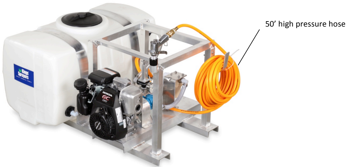
Figure 3: Side View